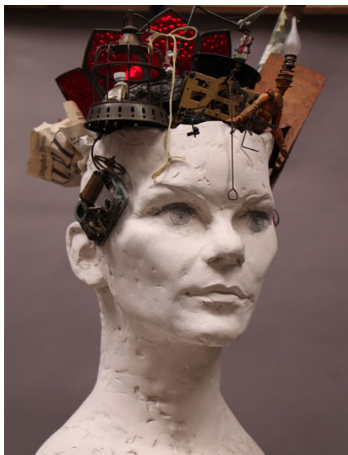
Eugene Daub, PLETHORA , Ceramic/Mixed Media, circa 2011, 24"